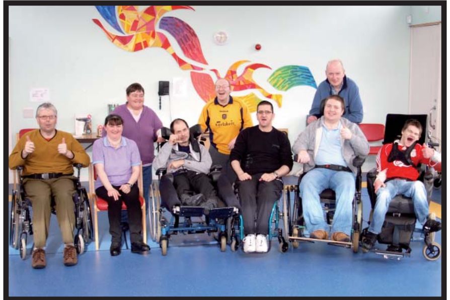
Users of the Manor Centre, Lurgan