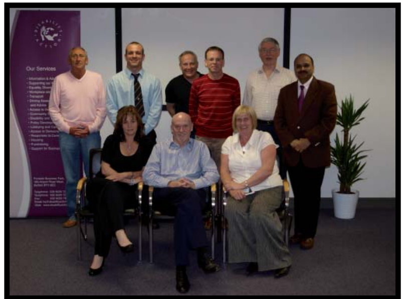
The Forum of Mobility Centre's Board of Directors at Disability Action May 2009

The Forum of Mobility Centres is a registered charity and has a network of 17 independent organisations covering England, Scotland, Wales and Northern Ireland.